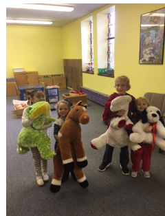
Kids enjoying the new carpet