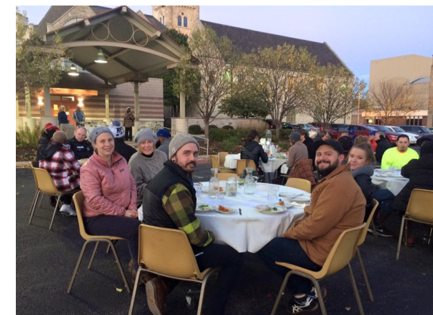
Photo from the first pop up dinner