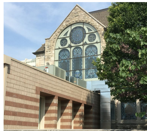
The Sanctuary has new a HVAC! We are already feeling the consistent effects.