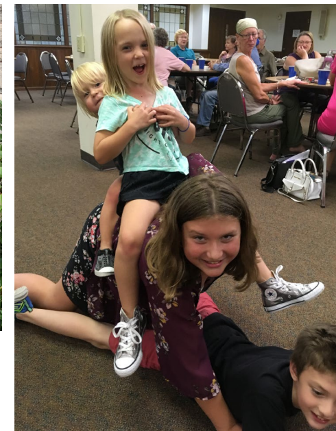
Too much fun was had at the Handbell Kick-off Pizza Party!