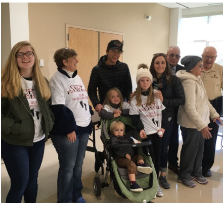
We walked for CROP! Some in body, many more by donation. Last year we raised more than any other organization in Rockford... we'll wait for this year's totals.