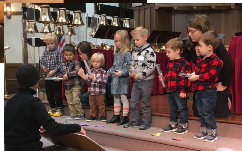
The Peanut Bells ringing Jesus Loves Me.