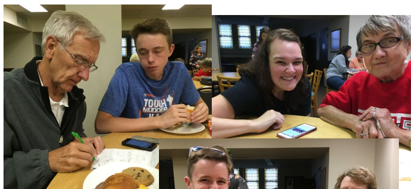
Both teens and adults enjoyed Tech and Talk!