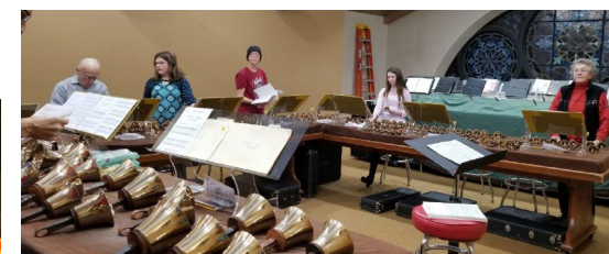
Our handbell ministries in their new practice location.