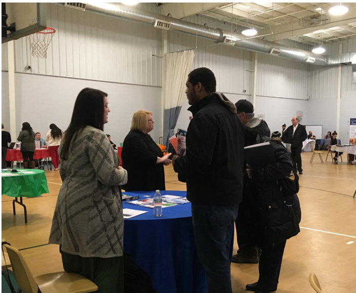
The Workforce Connection Job Fair: Our gym was full on January 15 with people trying to connect jobs to workers. They even offered haircuts for the interviewees!