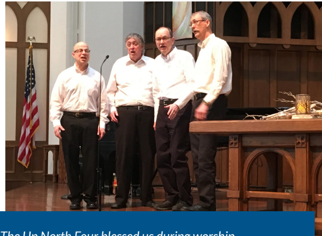
The Up North Four blessed us during worship.