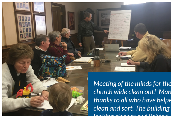
Meeting of the minds for the church wide clean out! Many thanks to all who have helped clean and sort. The building is looking cleaner and lighter!