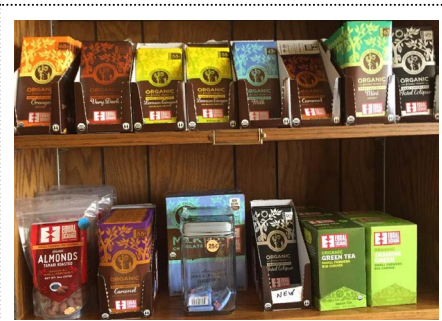
We have lots of dark and milk chocolate available at our Fair Trade Store!

Thursday, October 31 9:30 AM – Carillons 9:30 AM – Free showers 6:00 PM – Bellcantos 7:00 PM – Choir