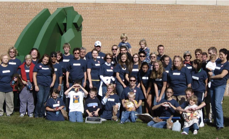
Those pictured above participated in Rockford’s 2010 CROP Hunger Walk. Were you a part of it? Make plans to join us this year!

CROP 50 YEARS OF WALKING. 50 YEARS OF ENDING HUNGER TOGETHER. Sunday, October 20