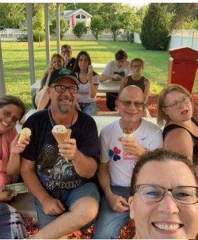
A smaller group braved the heat and humidity at Tower Hill this year. A total of 12 people enjoyed the cooling benefits of Lake Michigan.