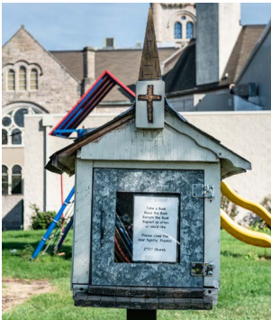
Right: Our church lending library is always a great option for finding a good story to read.