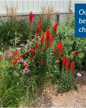
Our garden provided color and beauty on the grounds of the church all summer long.