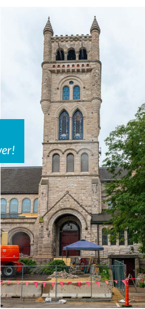
Good work continues on repairing the stone of the Tower!