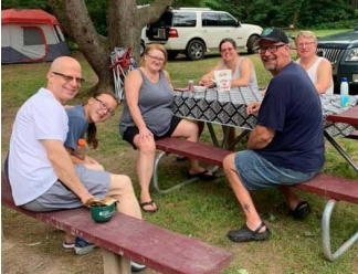
An outing at the pizza joint (with an ice cream stop on the way home) and a potluck cookout in the rain (actually, the pavilion came to the rescue)!