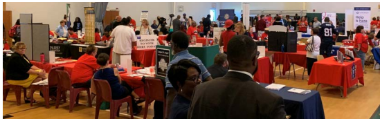
The Summit of Hope was held in our gym on Tuesday, August 27. We were honored to support our community in this way.