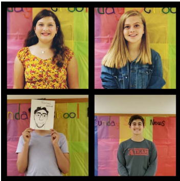
Left: Lots of smiles from the kids in our Sunday School class.

They were stewards of a shared path and a shared way of life. Our 2019 Stewardship season begins October 27. We will be reminded that stewardship is less about sharpening our pencils and more about sharpening our tools for trail maintenance and trail blazing, equipping ourselves to be caretakers of the path connecting us to our Creator and guiding our steps along the way. The early Christian movement was known as the way (Acts 9). The lives of faithful Christians are a way of being human, a way of interpreting, a way of practicing, a way of living as our fellow human being, Jesus, interpreted, practiced and lived to bring about the kingdom of God on earth. As we journey towards the reign of God, we are following in the tracks of others, ways walked by Jesus himself, paths as ancient as Abraham and Sarah. Today we are not just signposts pointing the way but the caretakers, the stewards of that way. Come and join in the way.