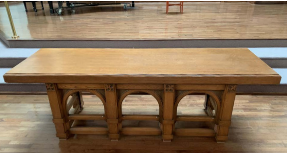
Rockford Finishing Company did a beautiful job refinishing our communion table.