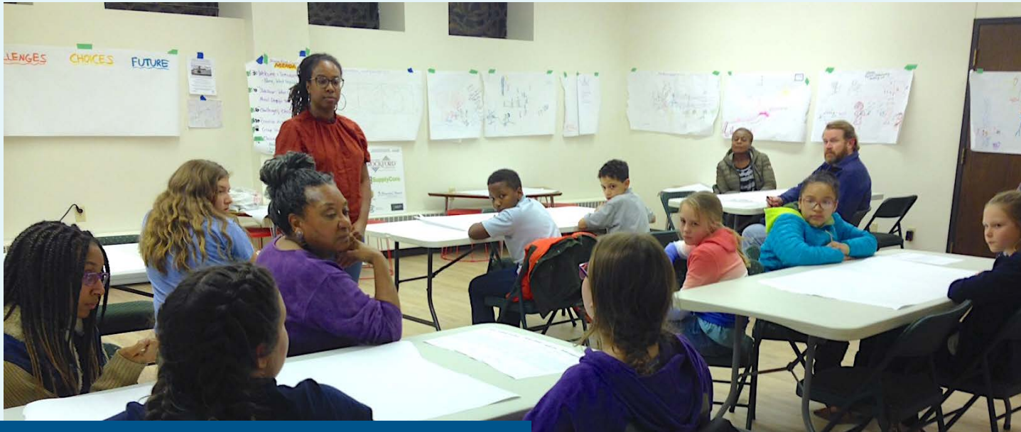
The kids provided great suggestions during the workshop on October 22nd.