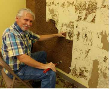
Work begins on the rehab of old Nursery room for the new Gathering Place.