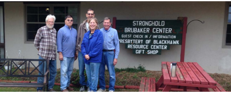
Members of SecondFirst Church worked at Stronghold in preparation for their Olde English Faire.