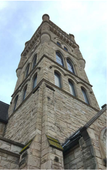
Stonework on the tower is almost complete!