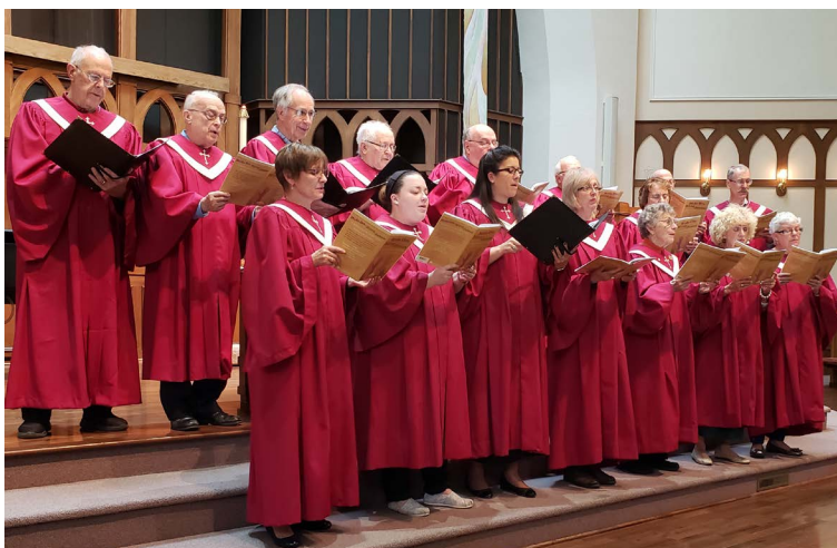
The Choir at Sunday Service.