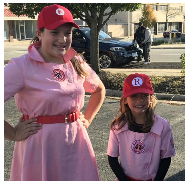
Our community had a great time at this year's Trunk or Treat! Thank you to everyone who participated.