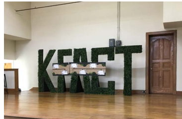
The KFACT Open House took place after worship on Sunday, October 27. The turnout was wonderful. It's rewarding and inspiring to see this space transformed and serving our community!