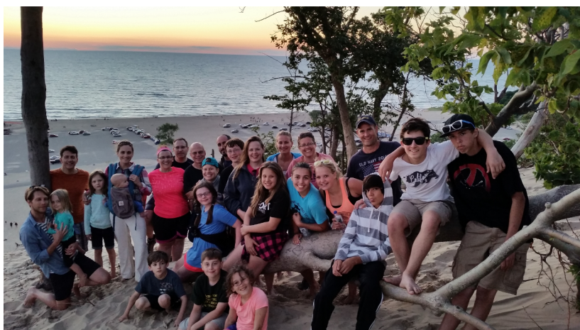
Part of the Second First group made it to the top of a sand dune to watch the sun set.