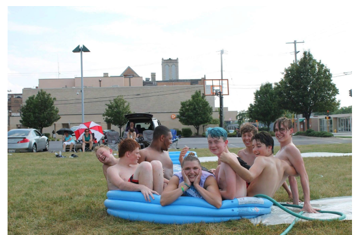
Transit Youth Group cools off after a fun game of Slip and Slide Kickball