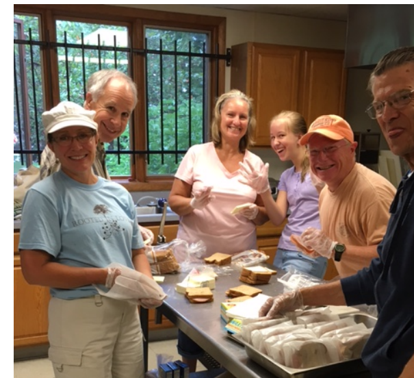
September's Soup Kitchen volunteers