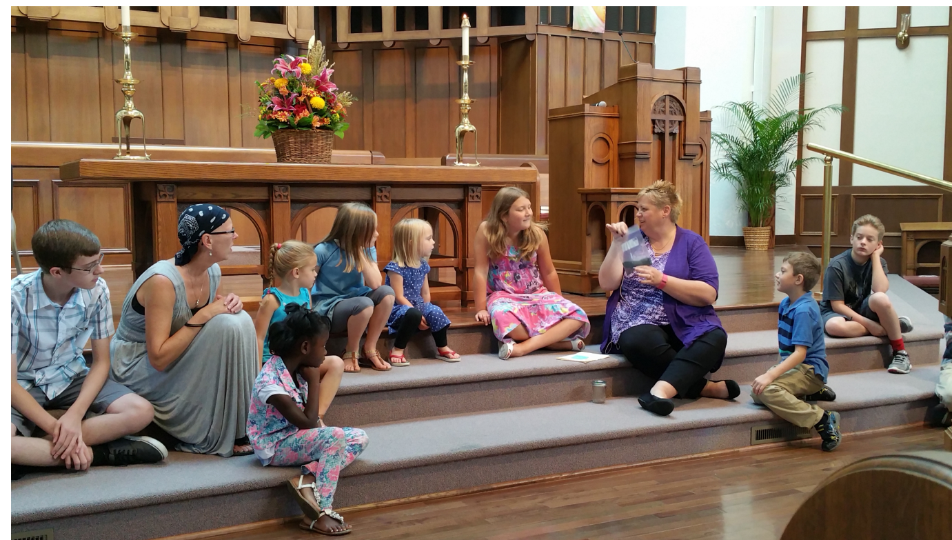
A moment during Early Word