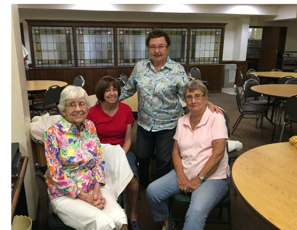
Hardworking Thrift Shop Ladies