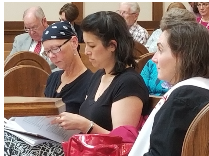
Annual program meeting