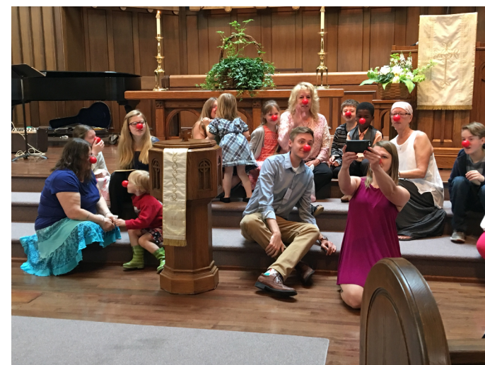
Red noses during Early Word