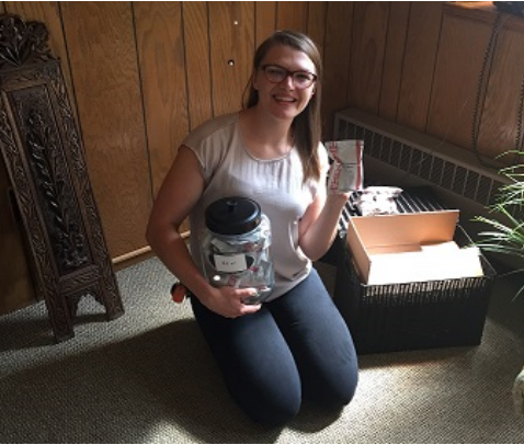
Courtney loves Decaffeinated coffee! Fair Trade now has some $2.00 sample packs for sale both regular and decaf.