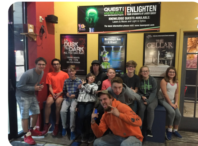
Transit youth group enjoying Laser Quest