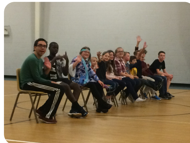
Wednesday night fun

The October meeting began by approving the September minutes and presenting the church report. The treasurer stated that we are over budget primarily due to unforeseen building expenses such as repairs to the air conditioning and alarm systems as well as an increase in insurance premiums. In new business, a motion was passed to authorize the Clerk of the Session to sign the 2017 year-end reports for SecondFirst Church for the General Assembly of PC(USA) and the Blackhawk Presbytery. In unfinished business, the draft of the strategic plan was discussed. Town-hall meetings for getting feedback from the congregation on the four strategies will take place on November 5th and 12th. Members from every ministry team will gather on January 25th from 6-7:30 to work on specific goals of the strategic plan. This year's Stewardship Campaign was also discussed. Highlights of the campaign include stewardship moments during the worship service and new pledge cards. The next meeting of Governing Council will be Thursday, December 21 at 5:30 in the 4th floor meeting room. Everyone is welcome to attend.