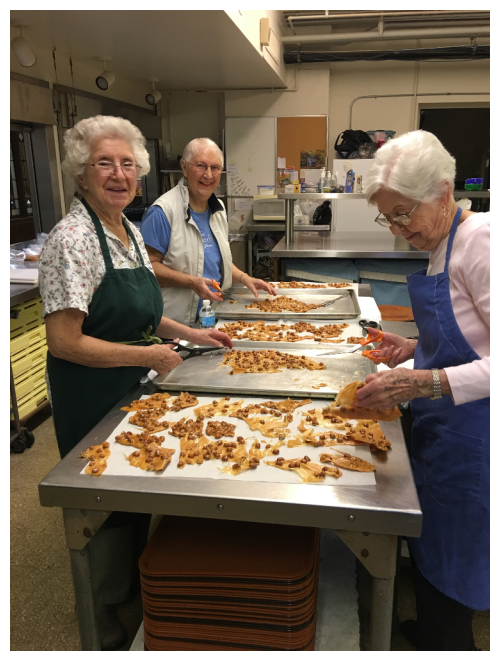
Peanut Brittle Party

Contact andy.newgren@secondfirst.org with questions or comments