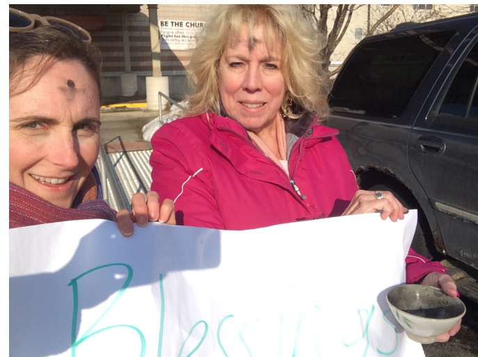
Your pastors took ashes to the streets.