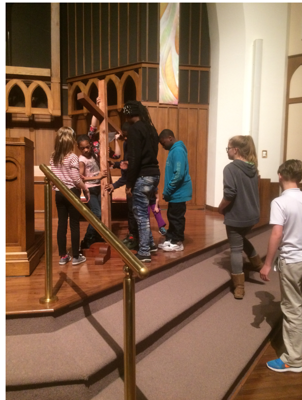
Setting the cross for Lent during Ash Wednesday worship.