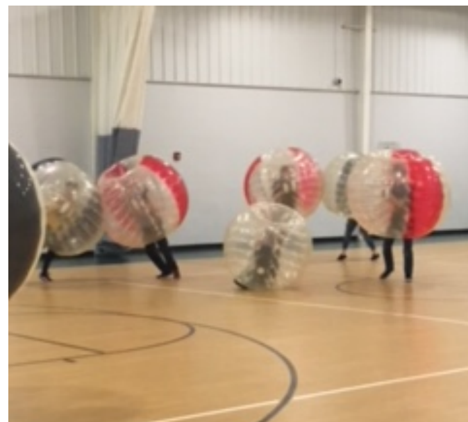
Transit Youth Group enjoying a game of Knockerball.