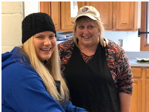
Serving at the Soup Kitchen

May is Peanut Butter Month! How many pounds of PB can we collect for the Food Pantry? 100? 200? 500?! Bring in jars of any size, deposit it into the crate at the back of the sanctuary, and we will let you know each week where we stand. How high can we go? Contact: Marge Maynard mtm.home@me.com .