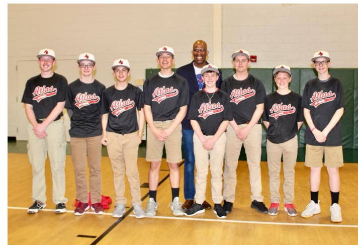
The Atlas Extreme youth baseball team helped serve pancakes at the Just Breathe 815 fundraiser