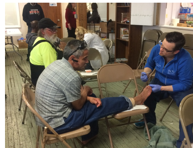
OSF foot doctors follow Jesus' command to wash feet on Maundy Thursday at Carpenter's Place