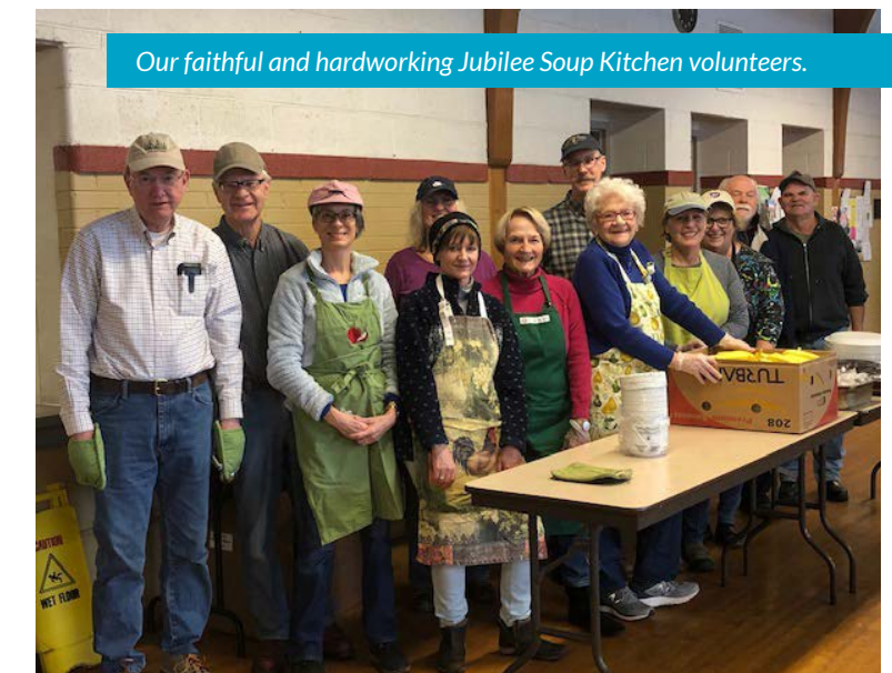
Our faithful and hardworking Jubilee Soup Kitchen volunteers.

For the winter season we will be open on Mondays from 10:00 am - 11:00 am for showers. Showers will be offered twice weekly again when the Overnight Café is over. For more information, contact: becky.erbe@secondfirst.org