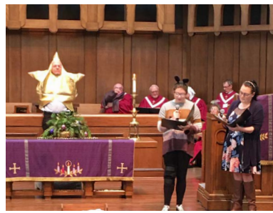
A collection of photos from our second annual pop-up pageant.