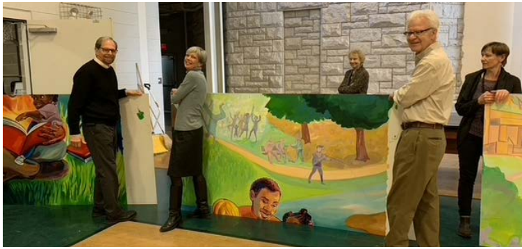
Members of the church helped move the mural panels into storage.