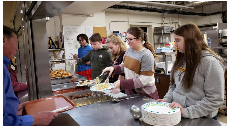
The youth from our congregation served a spaghetti dinner.