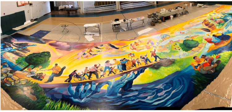
The mural is COMPLETE! All 55 mural panels were safely put into storage until a date is set for installation.