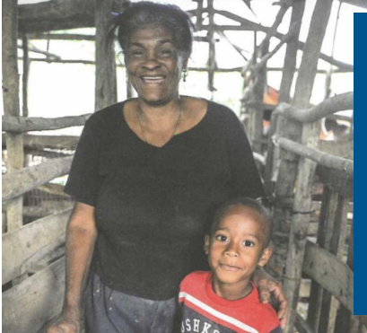
Church World Services honors our church. Our congregation has been the leading CROP Hunger Walk team in Rockford for many years. Rockford's walk raised nearly $32,000 of which our church gave $7,429.