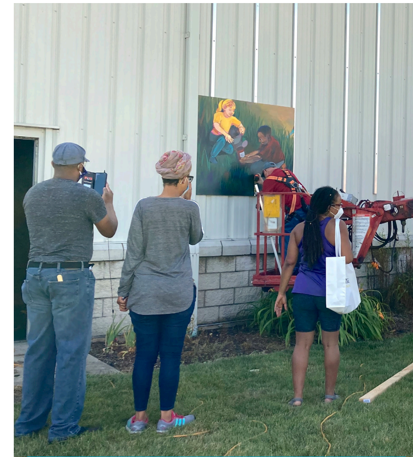
Above: The first panel of the mural is hung on the wall. Below: One by one, each panel is hung, bringing to life this community project.