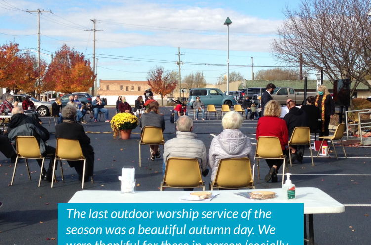
The last outdoor worship service of the season was a beautiful autumn day. We were thankful for these in-person (socially distant & masked) gatherings.