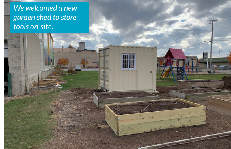
We welcomed a new garden shed to store tools on-site.