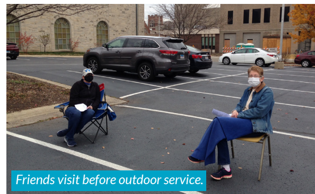
Friends visit before outdoor service.

SecondFirst Church is to be congratulated once again. Please visit my personal page: https://www.crophungerwalk.org/rockfordil/DavidJones to see the results.