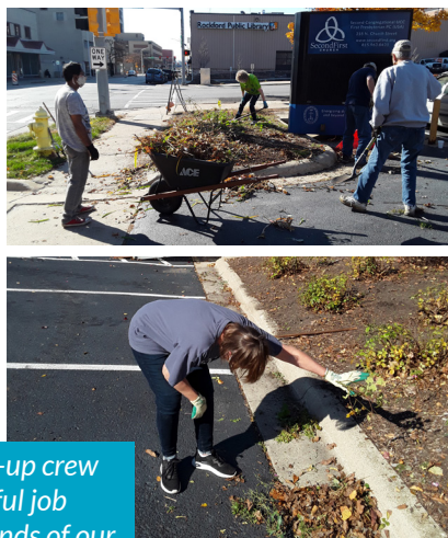
The fall clean-up crew did a wonderful job keep the grounds of our church beautiful!