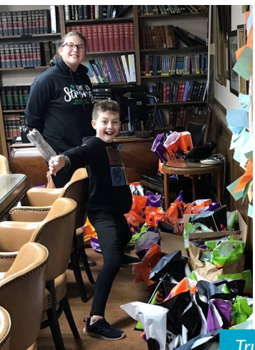
Trunk-or-Treat was a drive-through affair this year; still sweet as ever!