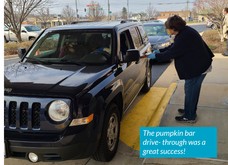
The pumpkin bar drive-through was a great success!