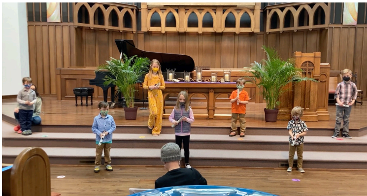
Peanut Bells perform Little Grey Donkey on Palm Sunday. Visit our YouTube page to watch the performance. http://bit.ly/secondfirst-youtube