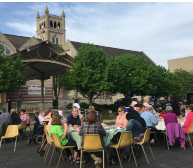
Save the Date for our Pop Up Event! Thursday, May 13. Watch for more information to come.