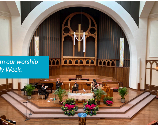
Scenes from our worship during Holy Week.