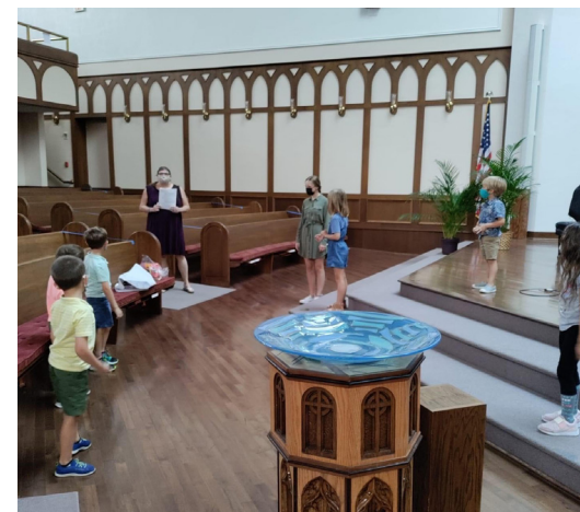
Sunday School fun in the Sanctuary, social distance style.

This fall is still somewhat uncertain because of the ever-changing conditions of COVID but we have an exciting new Sunday School curriculum called Shine that spans ALL ages! The Family Christian Education team and I are excited because there are writers from both of our denominations and includes a huge variety to keep conversations flowing and make each week different and exciting. One week we may be acting out a scene from the Bible and discussing the message in the context of our own lives. The next week we may be going on a field trip through the church to discuss accessibility and inclusivity. The focus of this quarter's curriculum is Seeking Justice. Just this last week we talked about playing favorites and judging others by their outward appearance. These discussions help the students to better understand Jesus' message in ways that relate to them. We prayed for people we know who have been treated unfairly and committed to leaving our assumptions about others at the door. I hope that as this new school year progresses, they take these lessons with them and view their own world through a Christ-like lens and treat others with the loving kindness of Jesus.