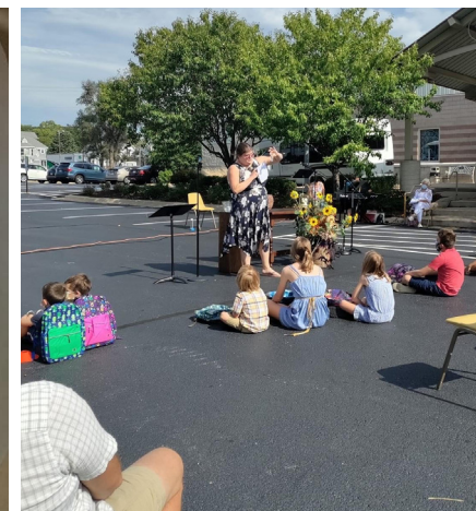
Blessing of the Backpacks during outdoor worship.