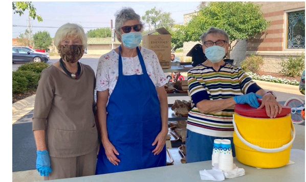
The Hospitality Team serving to-go muffins at our Fall kick-off.