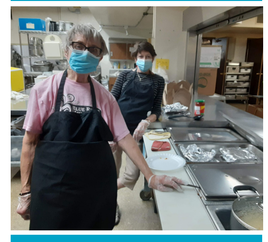
Serious Soup continues to feed those in need. Thank you to everyone who contributes to this program.