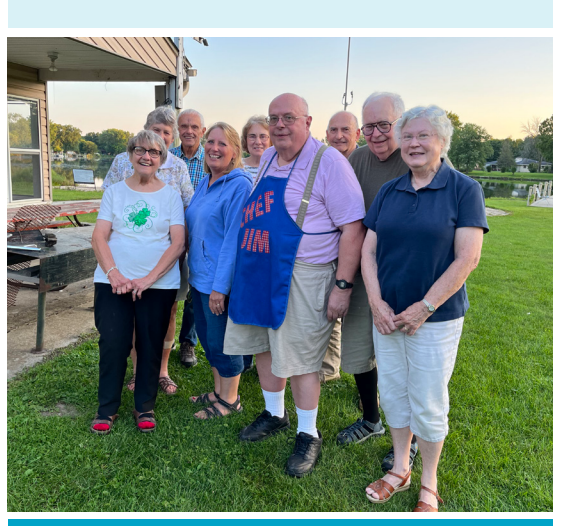
Gathering of 9 » A lovely time of fellowship, food, and friendship.