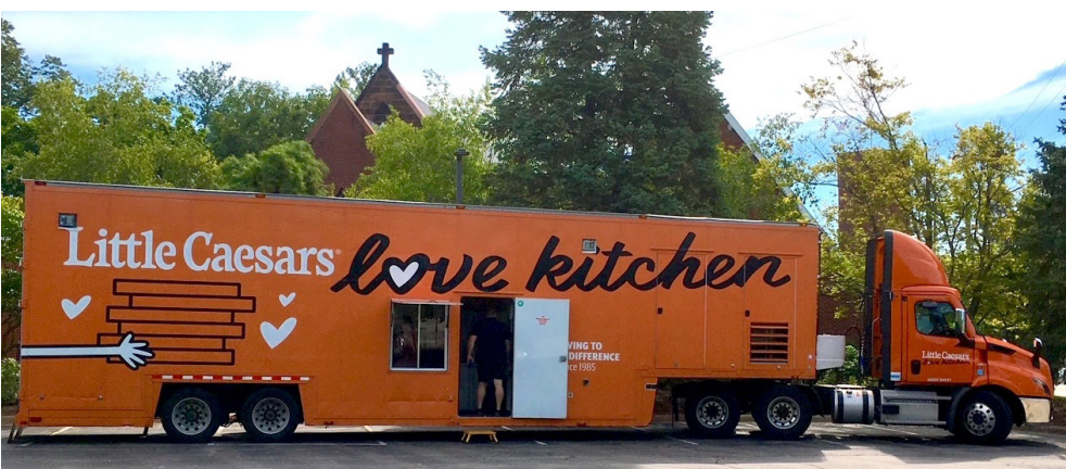
JUBILEE SOUP KITCHEN: A big crowd for Little Caesars Pizza By Jean Herro

We had an extra-large crowd at our Soup Kitchen at the Jubilee Center. It was mainly due the presence of an extra-large semi truck in the parking lot of the Jubilee Center. The Little Caesars Co. provided free pizza for our patrons. We were lucky enough to be on their charitable run across the USA. All 92 patrons received 2 or more slices of pizza plus the usual accompaniments, garlic bread, chips, cookies, fruit and water. There was enough pizza left to serve 60 Patrons at our own Serious Soup on Monday. Kudos to Little Caesars!