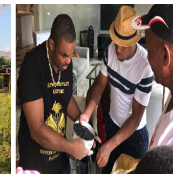
Heritage bean seeds