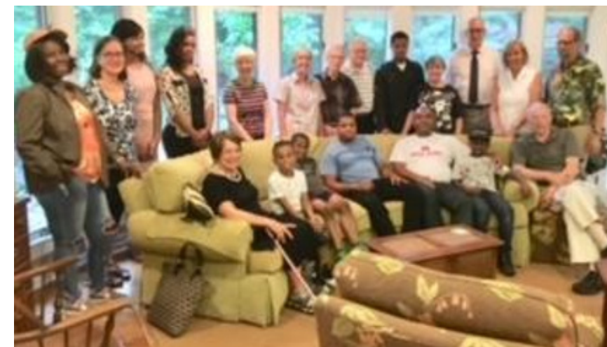
SecondFirst Church Haiti Interest Group Meeting