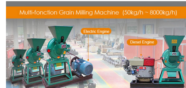
Examples of grain milling machines

James & Odette Casimir Email casimir0401@gmail.com Cell 815-319-0741