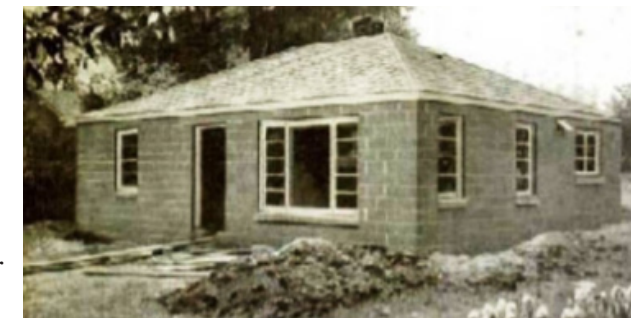
A simple cinder block building