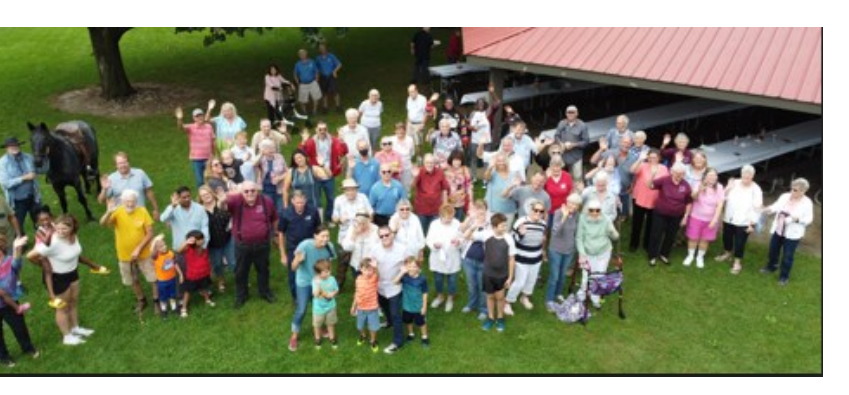
We ask you stay for our new annual drone picture.

We will be returning to Anna Paige Park for our annual church picnic! The bus will be running and we will be offering snacks to those waiting for festivities to begin. We are so excited to see everyone and go back to a great time of