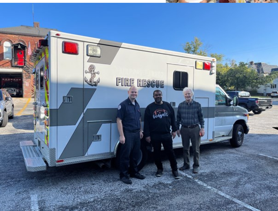
An Ambulance for Haiti