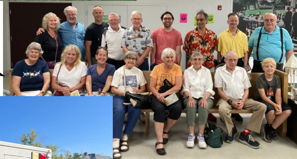
Excursion to the Historic Auto Attractions Museum