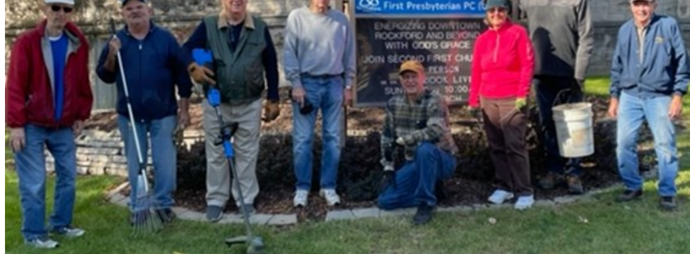
The Landscape Crew