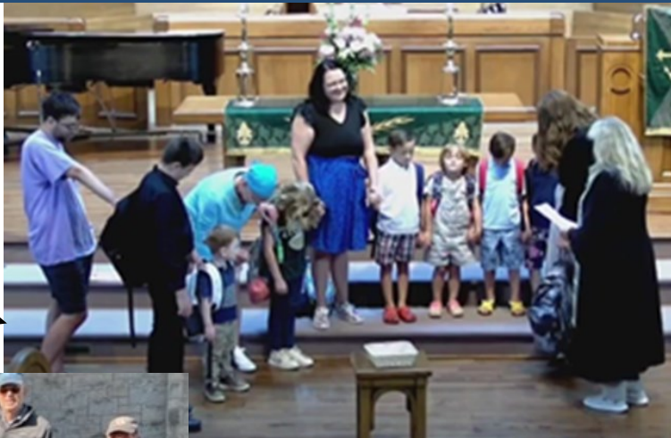
Blessing of the Backpacks