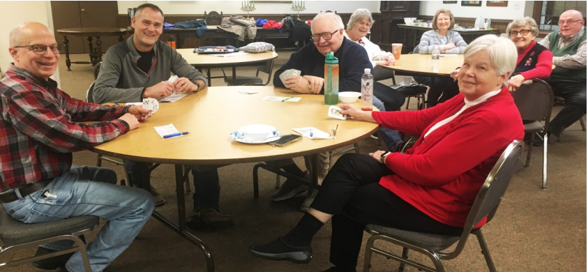
Euchre players enjoying a fun night of friendly competition and good food. The next Euchre night will be Wednesday, April 10 at 6:30 PM